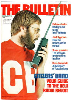
The Bulletin December 1976