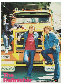
The Truckies(ABC TV) 1978